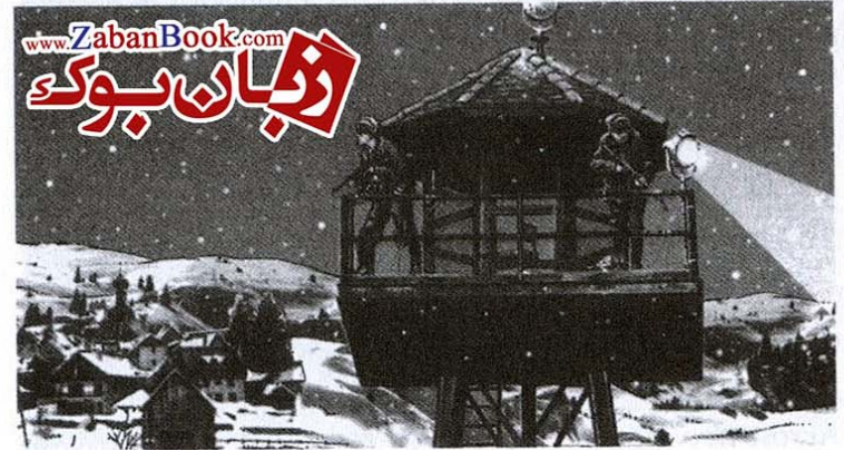
The border guards watch day and night.

In a house in the village a man and a woman are talking. The woman holds a six-month-old baby boy in her arms.